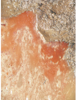
Bulk product now removed